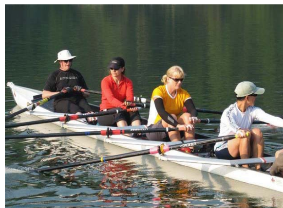
Members of the South Cariboo Rowing Club on Bridge Lake

For the 3rd consecutive year, we are pleased to welcome members of the South Cariboo Rowing Club, who come to the Interlakes area to participate in the Cariboo Tour. This "just for fun" tour takes place on three local lakes: Bridge Lake, Lac Des Roches, and Canim Lake. The teams row skulls of 4 (a "quad"), with a coxswain. The Club offers many programs including youth and adult "learn to row". Keep up the good work, and we look forward to seeing you again next year!